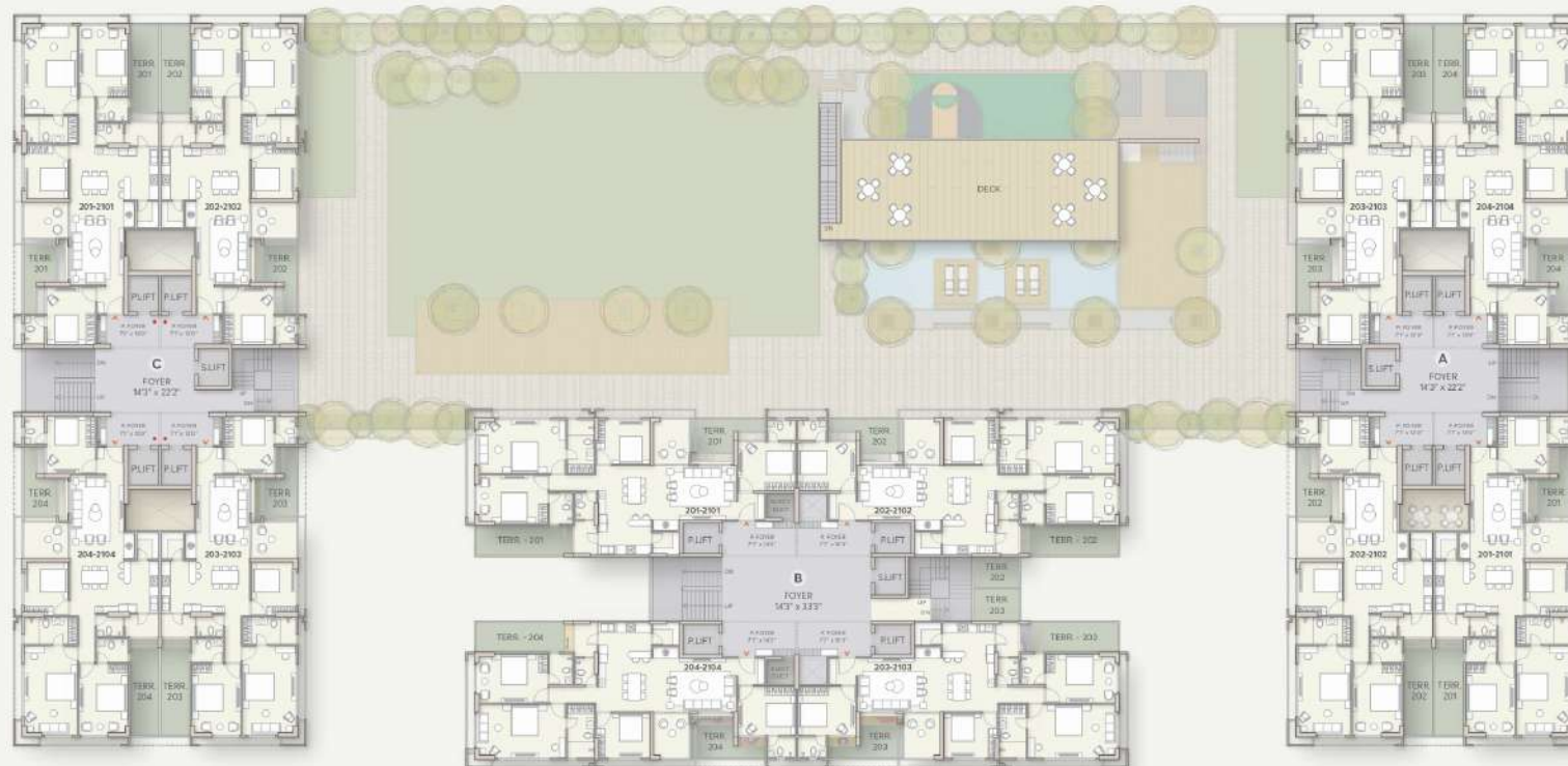
TYPICAL FLOOR PLAN 2nd to 21st floor