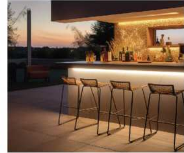
Open-to-Air Party Kitchen