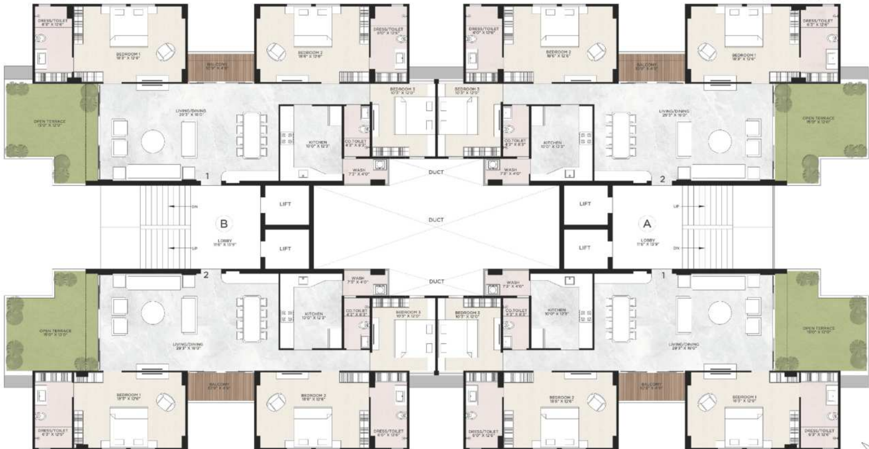
14TH FLOOR PLAN

3BHK S.A. = 3003.00 Sqft(278.98 Sqmts) C.A. as per Rera = 1544.74 Sqft (143.51 Sqmts) Open terrace = 411.00 Sqft(38.19 Sqmts)