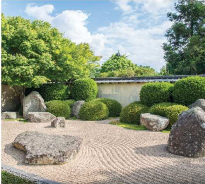
Proposed Zen/Miyawaki Garden