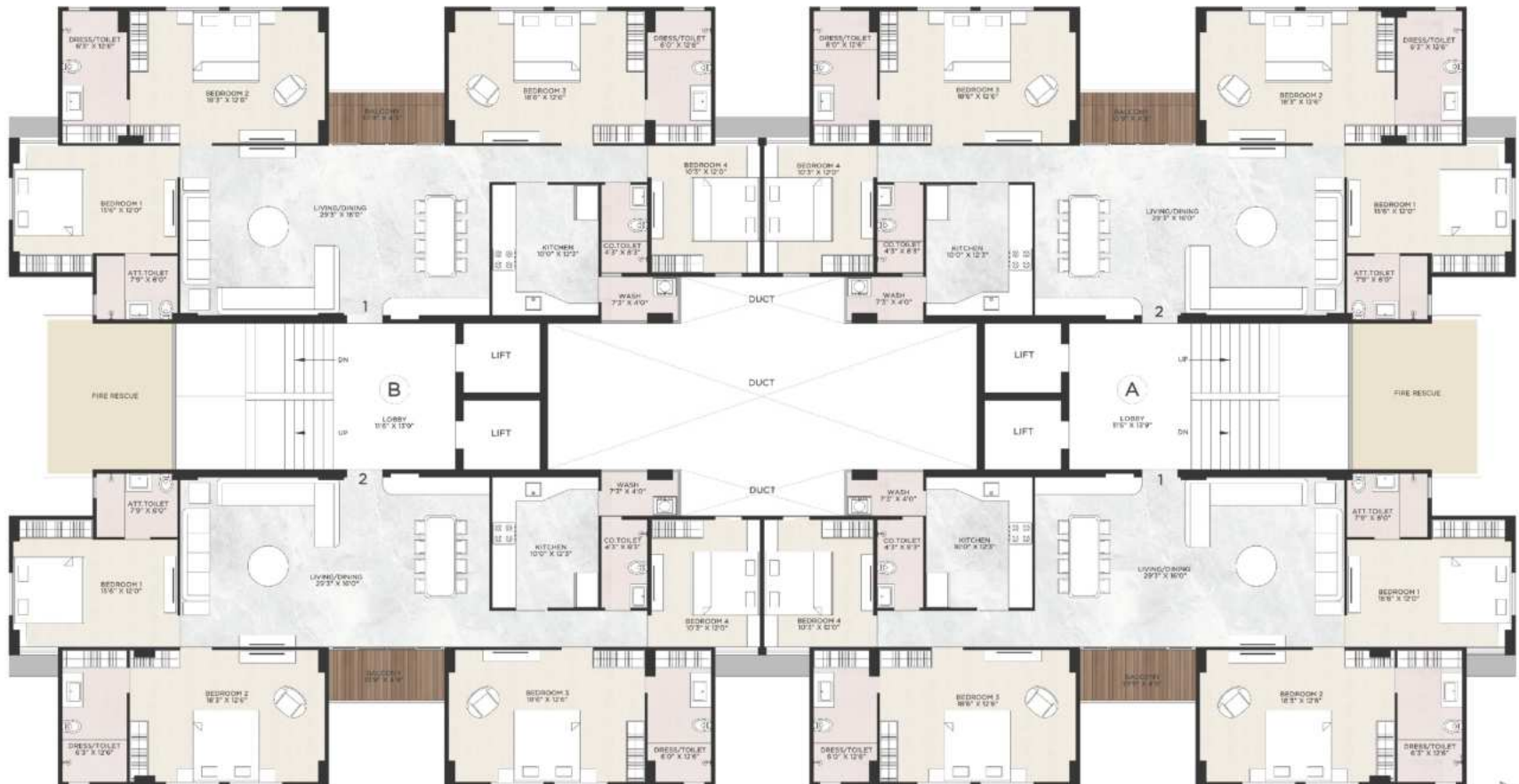
13 TH FLOOR PLAN

4BHK S.A. = 3430.00 Sqft(318.65 Sqmts) C.A. as per Rera = 1766.00 Sqft (164.06 Sqmts)