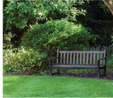
Senior Citizen Sit-Outs